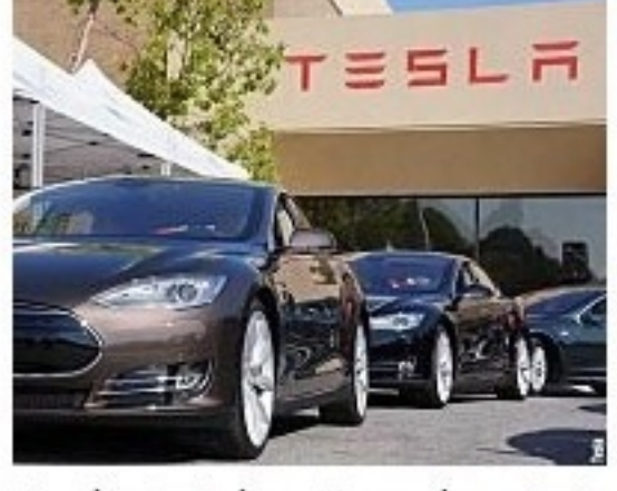
Tesla October Surprise: Is It Date With A Model? Investors.com