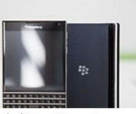
BlackBerry Passport - Review DrPrem.com