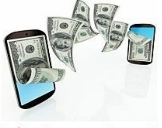
Twitter Becomes a Payment Channel CFO.com