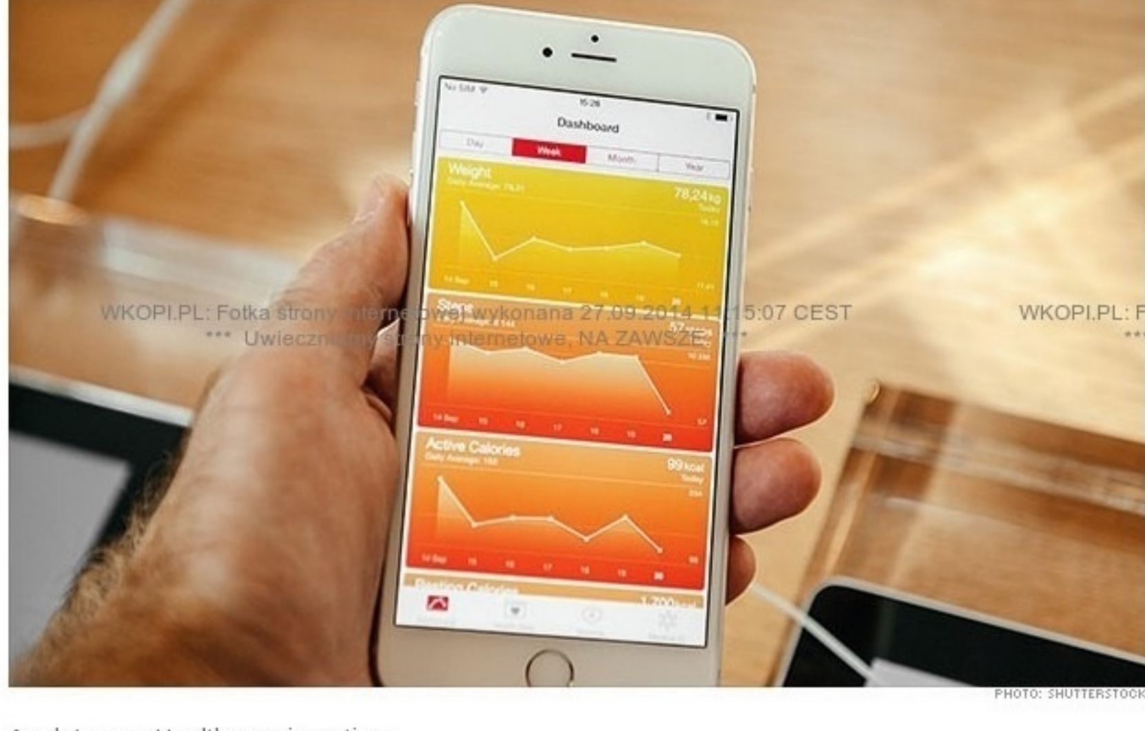
Apple's new Health app in action.

By James O'Toole @jtoole September 26, 2014: 6:11 PM ET