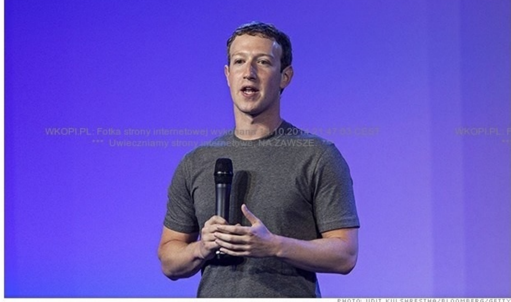
Mark and Priscilla Zuckerberg were the most generous donors in 2013, according to The Chronicle of Philanthropy.

Facebook, Twitter, LinkedIn, Email, Print, RSS, StumbleUpon, Dribbble, Pinterest, Google+, Print, RSS, StumbleUpon, Dribbble, Pinterest, Google+